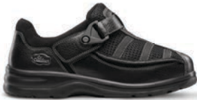
Lucie X Black 2610