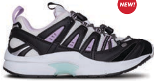
Refresh Lilac 3955R