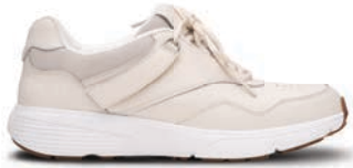
Peter Beige 51630