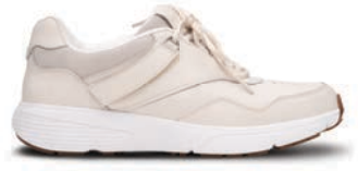
Theresa Beige 11730