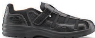
Betty Black 3810