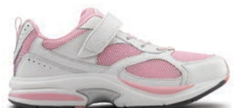
Victory - Pink 3470