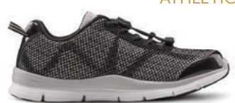
Jason Black 77710