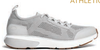
Jack Grey 51080