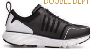
Grace X Black 11310