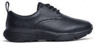
Ruth Black 10510