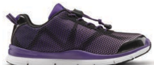
Katy Purple 37755