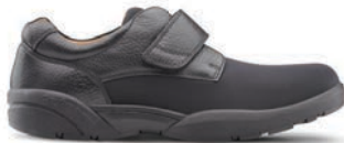
Brian Black 6410