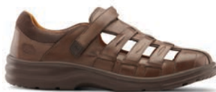
Breeze Coffee 0820