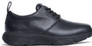
Roger Midnight 10411