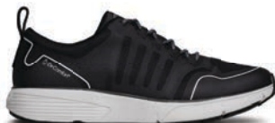
Gordon Black 10110