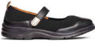
Jackie Black 10710