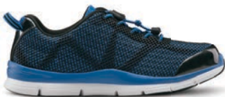
Jason Blue 77750