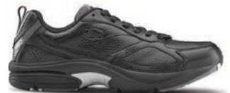
Winner Plus Black 7210