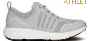
Gordon Grey 10180