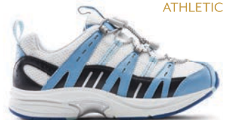
Refresh Blue 3950