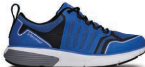
Gordon Blue 10150