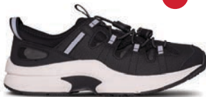
Earhart Black 11910R