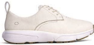
Ruth Nude 10530