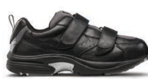
Winner X Black 7710