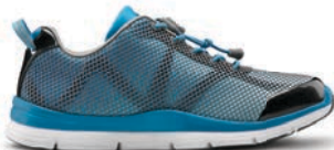
Katy Turquoise 37750