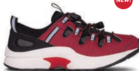
Earhart Burgundy 11970R