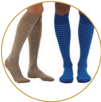
EASY STREET STRIPE