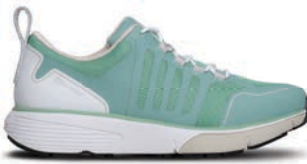
Grace Seafoam 10325