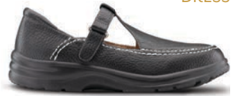
LuLu Black 4610 P