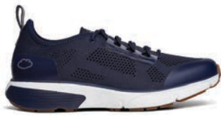
Jack Blue 51050