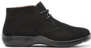
Cara Black 38010