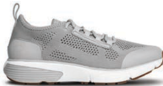
Diane Grey 10680