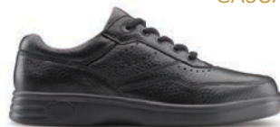
Patty Black 1010