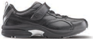
Winner Black 5710