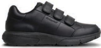
Angela Black 11810