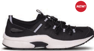
Polo Black 51810R