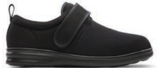
Carter Black 9110