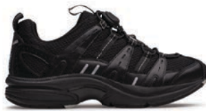
Refresh Black 3910