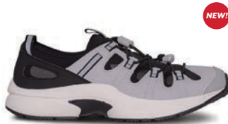
Polo Grey 51880R