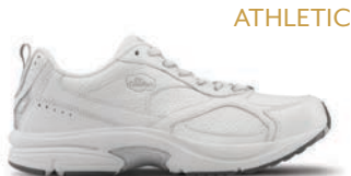
Winner Plus White 7240