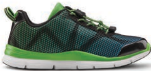
Katy Green/Turquoise 37725