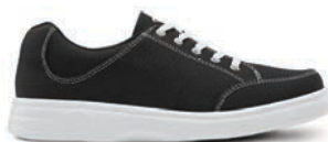
Riley Midnight 0250