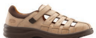
Breeze Light Gold 0830