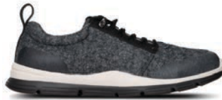
Sean Grey 51580