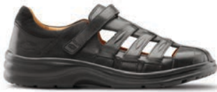
Breeze Black 0810