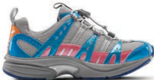
Refresh Berry 3976 P