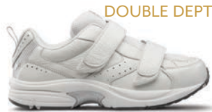
Winner X White 7740