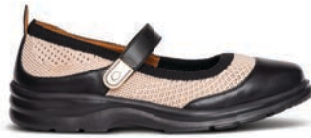
Jackie Nude 10730