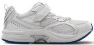
Victory - White 3440