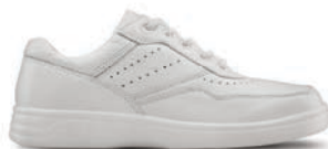
Patty White 1040