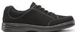
Riley Black 0210