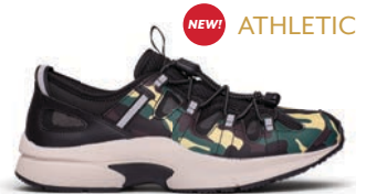
Polo Camo 51806R