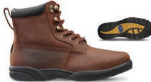
Boss Chestnut 9520