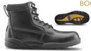
Protector (Steel-Toe) Black 9310