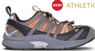
Performance Copper 7621R