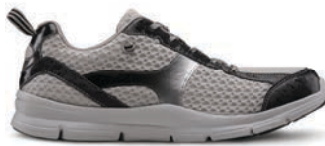
Chris Grey 77880