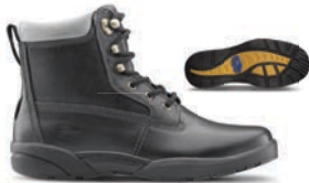
Boss Black 9510