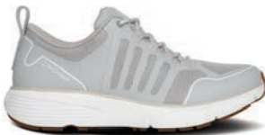
Grace Grey 10380