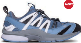
Performance Cobalt 7655R