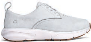
Ruth Grey 10580