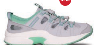
Earhart Grey 11980R