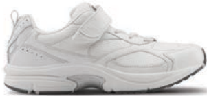
Winner White 6740