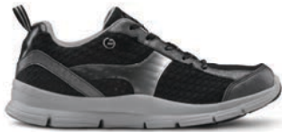
Chris Black 77810