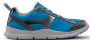
Meghan Turquoise 37850