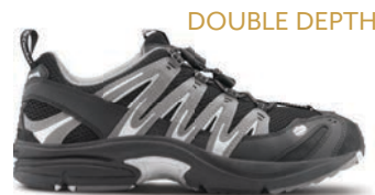
Performance X Black/Grey 9910