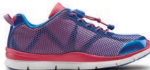
Katy Pink/Turquoise 37770