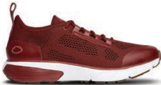
Diane Red 10670