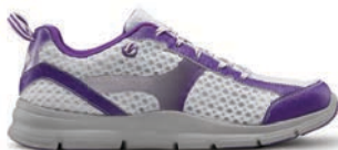
Meghan Purple 37855