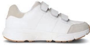
Angela White 11840