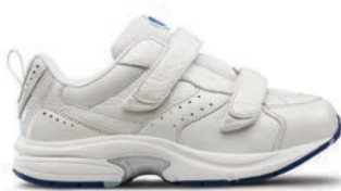
Spirit X - White 2440