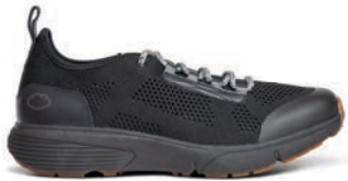
Jack Black 51010