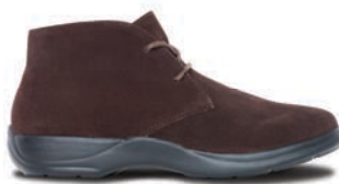
Cara Brown 38020