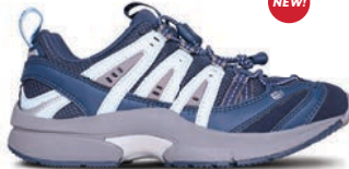
Refresh Sapphire 3951R