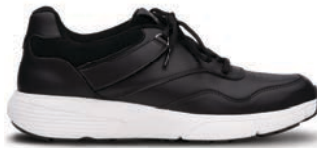
Theresa Black 11710